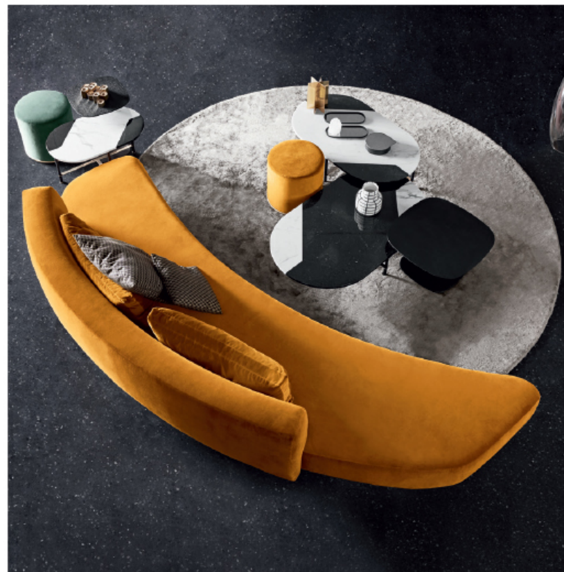
Audrey, sofa | Chanel, coffee table | Cookies, coffee table | Lou, pouf